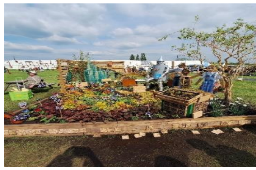
RHS Malvern Spring show