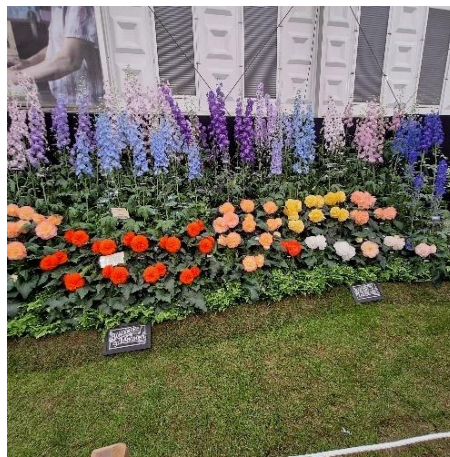
Chelsea Flower Show